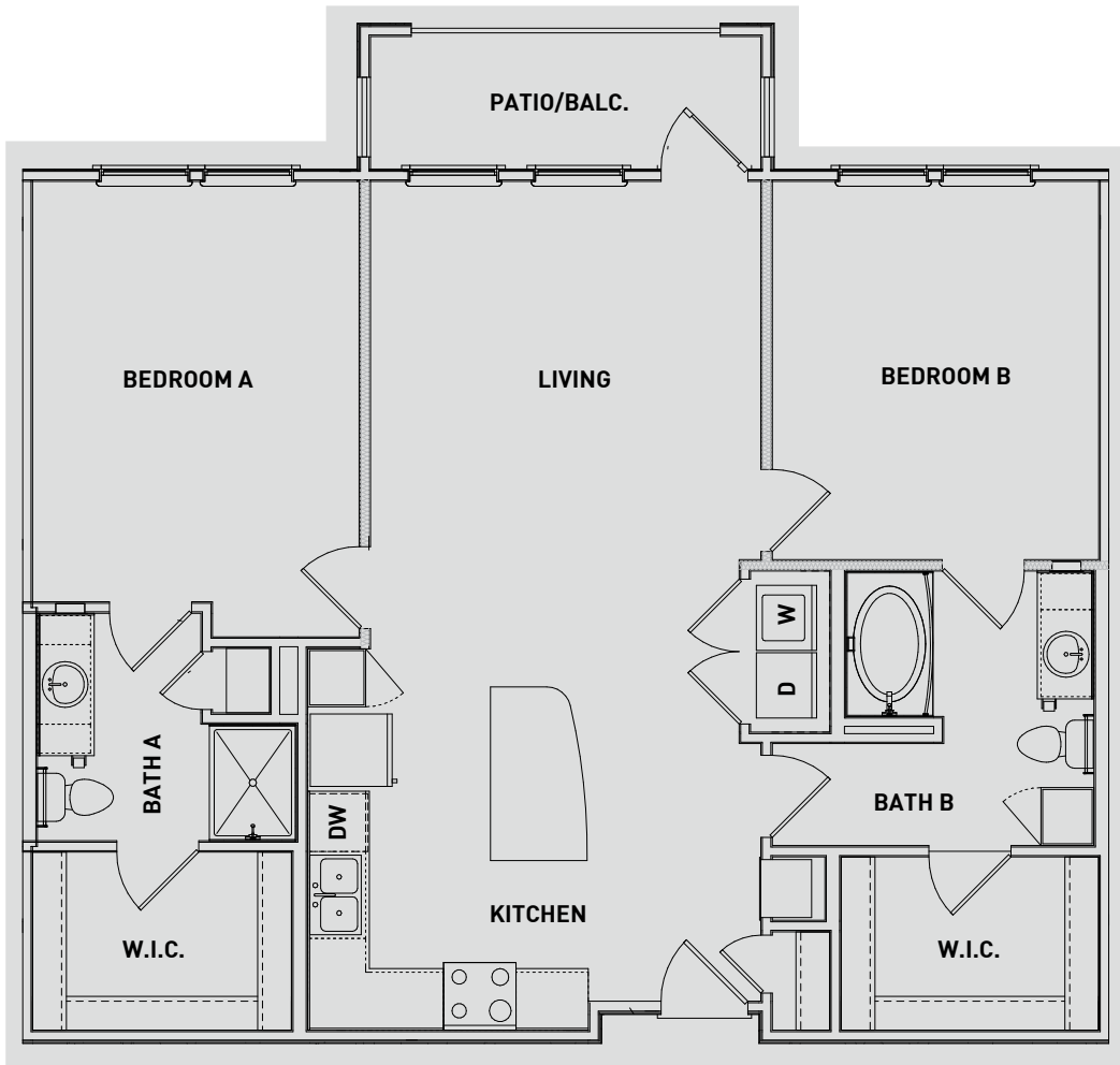
UNIT B2-A 1117 SQ. FT.